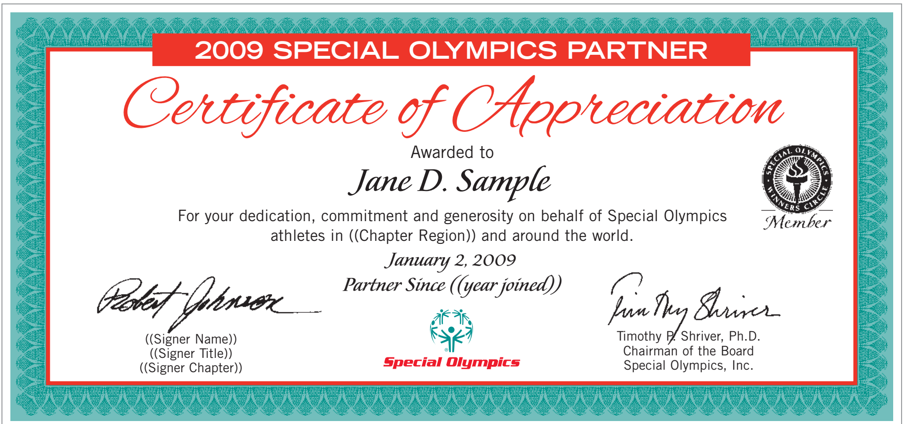
Moore Certificate size: 9-1/2" x 4-1/2" Colors: 2C - PMS 327 Green, PMS 485 Red

Awarded to: Trade Gothic 13/28 Donor Name: Florens 30/25 (space after is: 8pt leading) For your: Trade Gothic 12/15 Date/Partner: Florens LP 18/19 Signatures & WC logo: provided as TIFF images Signer Info: Trade Gothic 10/11