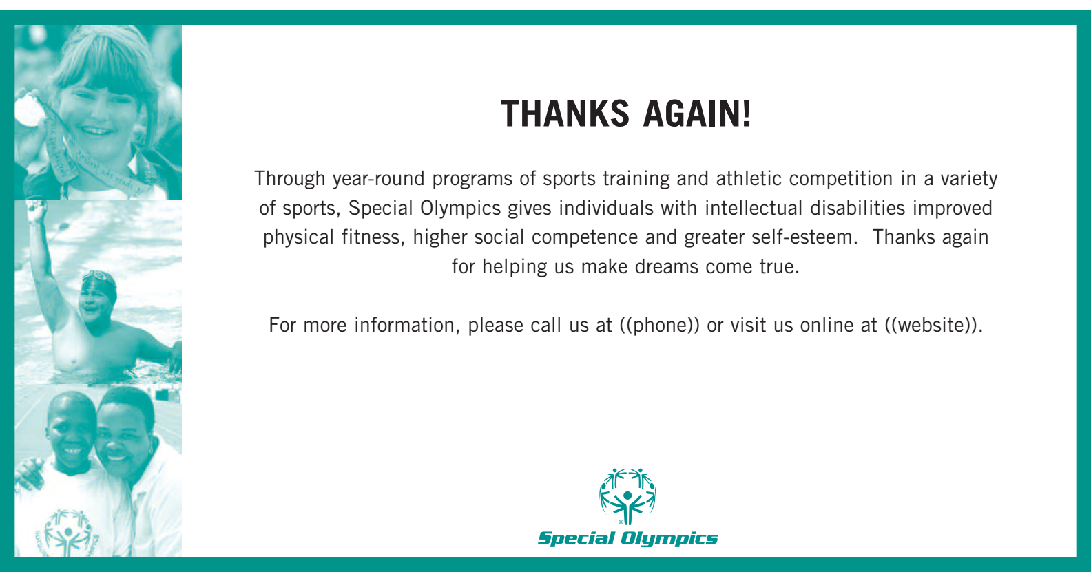
Schedule of Events - Lift Note (back) size: 8-1/2" x 4-1/2" Colors: 1C - PMS 327 Green

Header: Trade Gothic Bold 20/22 Through year-round...: Trade Gothic 11/16