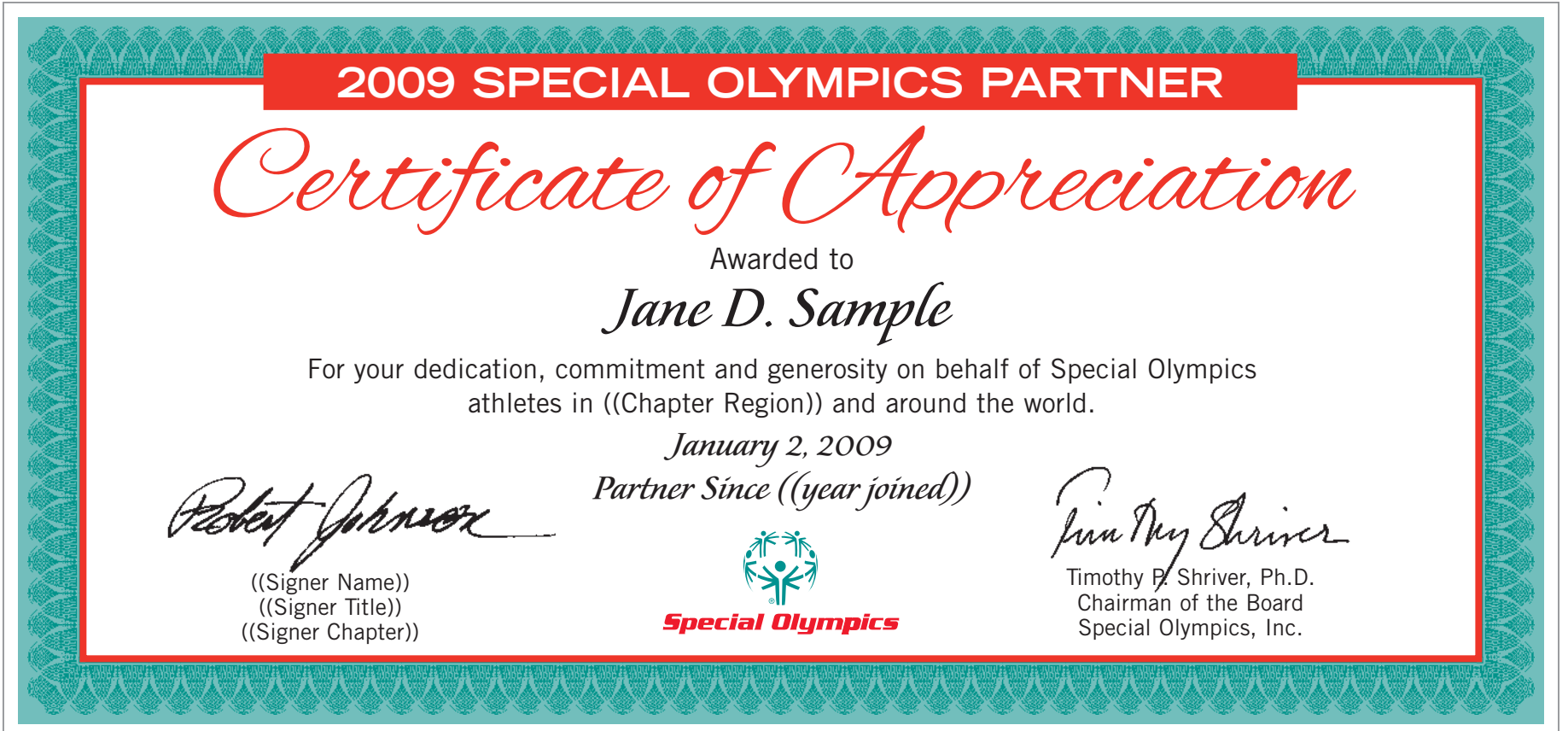
Moore Certificate size: 9-1/2" x 4-1/2" Colors: 2C - PMS 327 Green, PMS 485 Red

Awarded to: Trade Gothic 13/28 Donor Name: Florens 30/25 (space after is: 8pt leading) For your: Trade Gothic 12/15 Date/Partner: Florens LP 18/19 Signatures: provided as TIFF images Signer Info: Trade Gothic 10/11